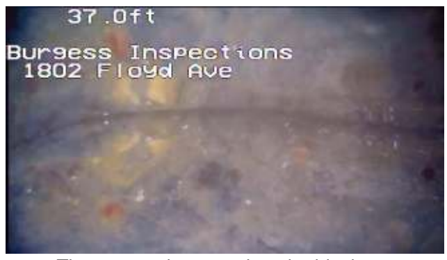
The camera is up against the blockage