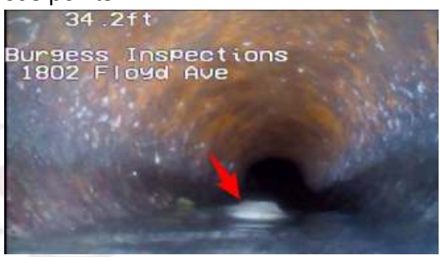
Debris in the pipe at approximately 34.5 ft from the access point

13: At approximately 37 feet, there was a blockage in the pipe. The camera could not get past this point. While water was running, the pipe was holding water and debris. After shutting off the water, most of it cleared out. It could not be determined if it drained out or if there is a leak. There is a possibility that the joint is offset causing the blockage. Due to the blockage, any offset is not visible.