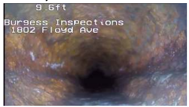
Cast Iron is rusted and corroded.

11: Heavy rust / scale was visible in the cast iron portion of the main sewer line/pipe.