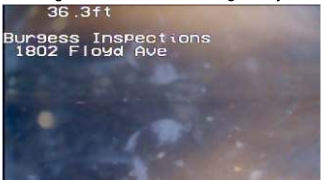
Camera is underwater

13: At approximately 37 feet, there was a blockage in the pipe. The camera could not get past this point. While water was running, the pipe was holding water and debris. After shutting off the water, most of it cleared out. It could not be determined if it drained out or if there is a leak. There is a possibility that the joint is offset causing the blockage. Due to the blockage, any offset is not visible.