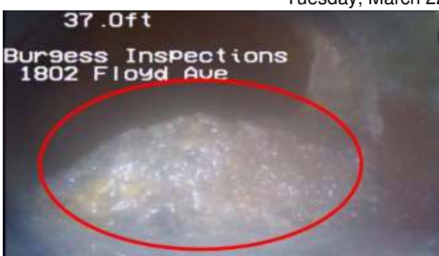
Site of the blockage