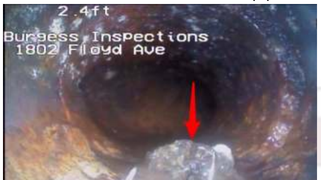
Debris in the pipe at approximately 2.4 ft from the access point

12: There was debris inside the pipe at various points.