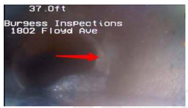
Another shot of the blockage. This shows the potential offset of the pipe at the arrow.